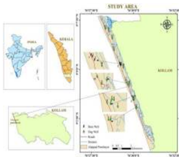
Figure 1: Location map of Alappad coast and groundwater sampling stations in Kollam, Kerala, India. Alappad coastal area heavily devastated by 24 th December 2004 Indian Ocean tsunami (A coast having rich black mineral sand deposit and exposed to coastal hazard and sea water intrusion)

prevailed in this coastal segment over the years. Study is mainly focussed on irrigation water quality parameters and corrosion indices of groundwater of the study area. Parameters are determined/ assessed to find the suitability of water for irrigation as well as for industrial application. The location map of the study area with sampling sites is given in Figure 1.